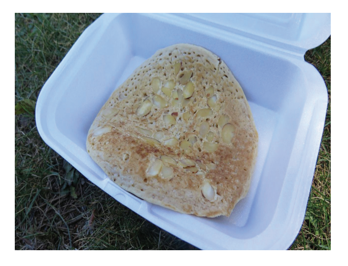
A delicious Burmese pancake.

www.cnn.com/travel/article/myanmar-foods-try/index.html